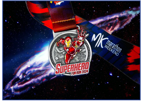
This medal will be waiting for you at the finish!